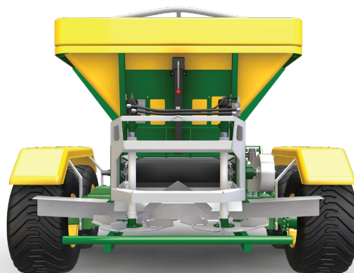
6 tonne tandem-axle (with load cells)

Designed for spreading processed fertiliser including superphosphate, urea and lime. SAM Combo's will also spread a range of organic products like chicken and pig manure, screw-pressed effluent and sand. SAM Combos allow spreading rates of 40kg - 2,500kg per hectare with spreading widths of up to 20m (for urea).