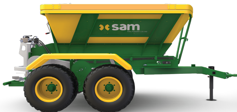
5 tonne tandem-axle