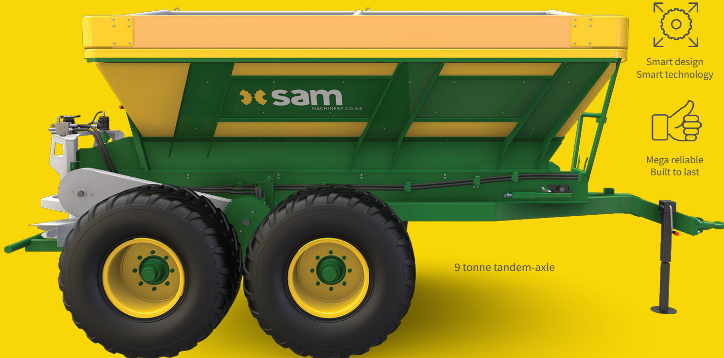
9 tonne tandem-axle